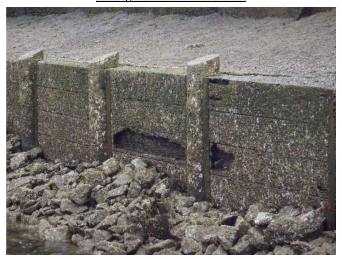
Current Lagging Degradation