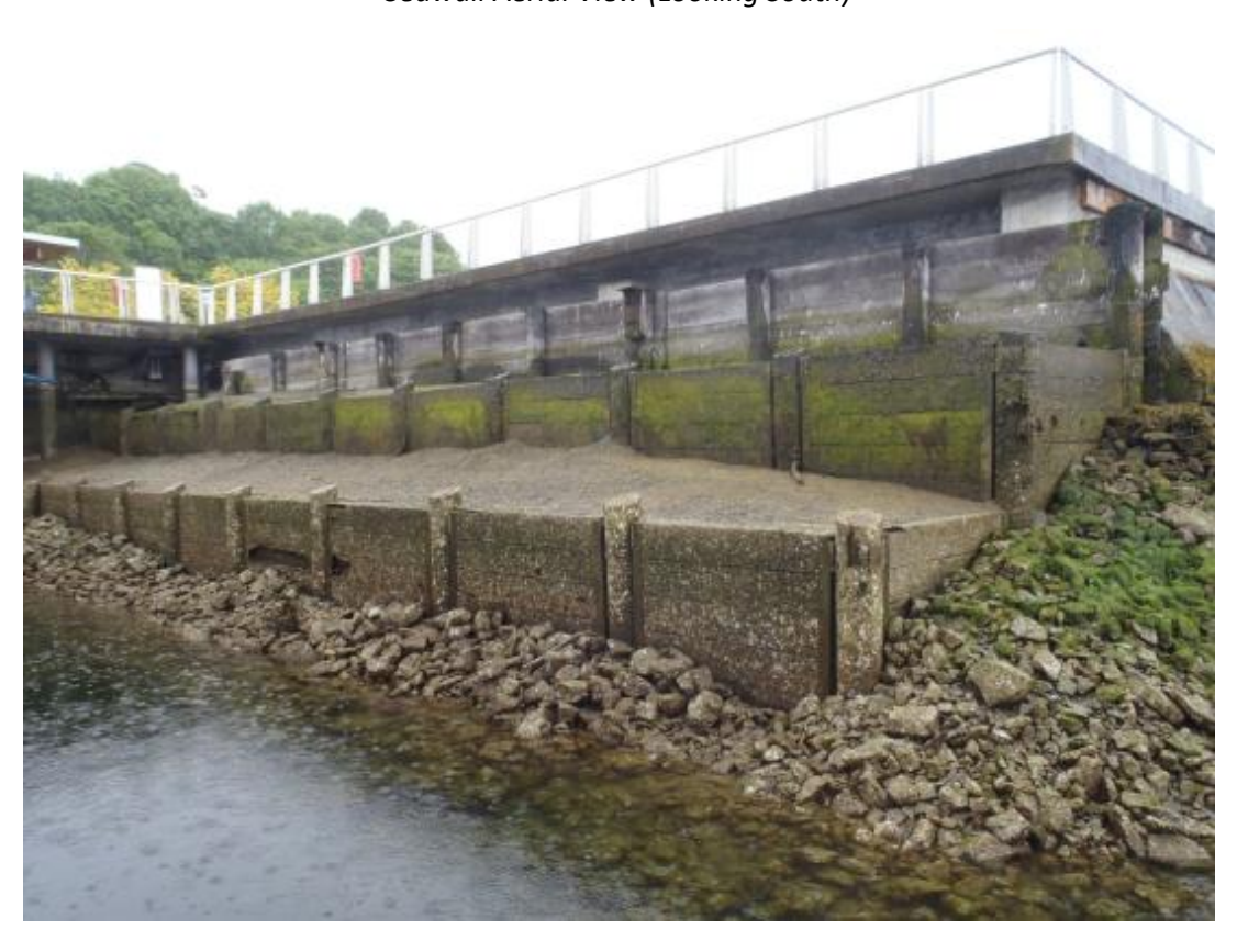
Seawall Overview (at zero tide)